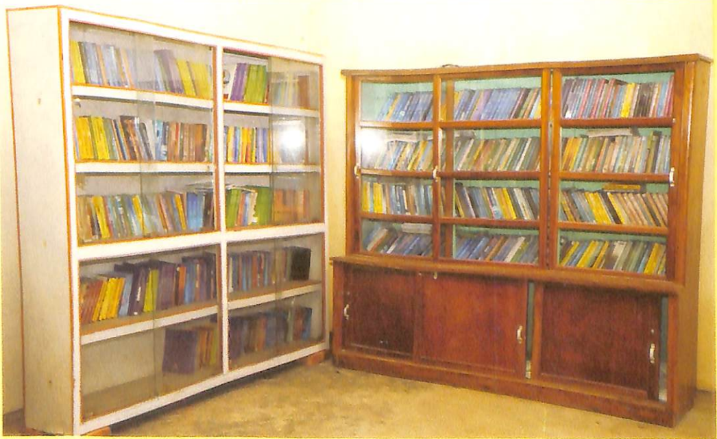
A view of Patidarrang College Library.